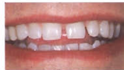
SPACES - BEFORE