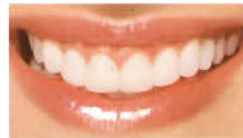
AFTER WITH CERINATE