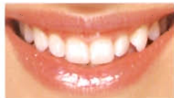
CHIPPED - BEFORE

SMILE IMPROVEMENTS TOOK PLACE WITHOUT REMOVING SENSITIVE TOOTH STRUCTURE!