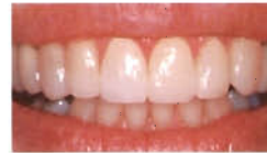
AFTER WITH CERINATE