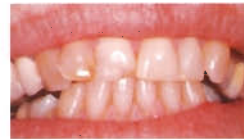
STAINED - BEFORE