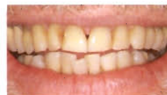
YELLOW-CROOKED - BEFORE