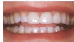
AFTER WITH CERINATE