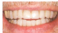
AFTER WITH CERINATE